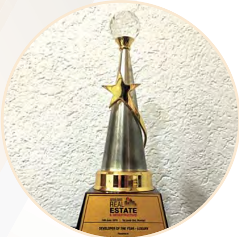
Developer of The Year - Luxury Real Estate