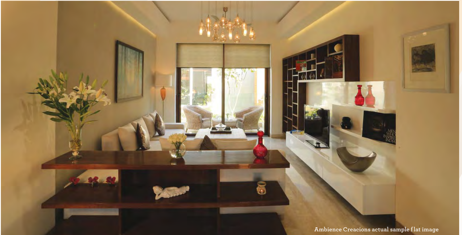
Ambience Creacions actual sample flat image