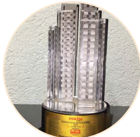
Residential Property of The Year Real Estate