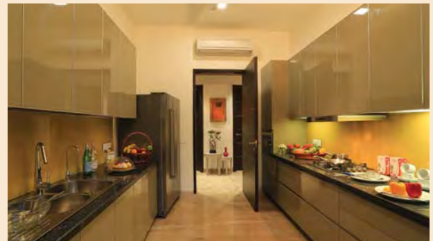
Ambience Creacions actual sample flat image