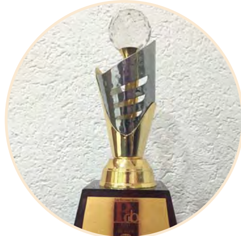
Brand Excellence Award Real Estate