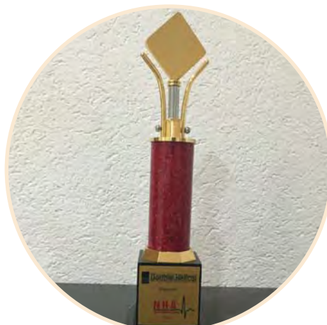
National Health Awards Real Estate