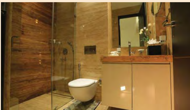
Ambience Creacions actual sample flat image