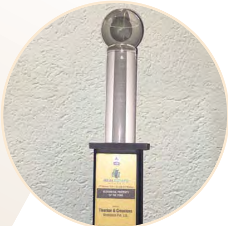
Residential Property of The Year Real Estate