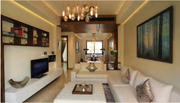
Ambience Creacions actual sample flat image